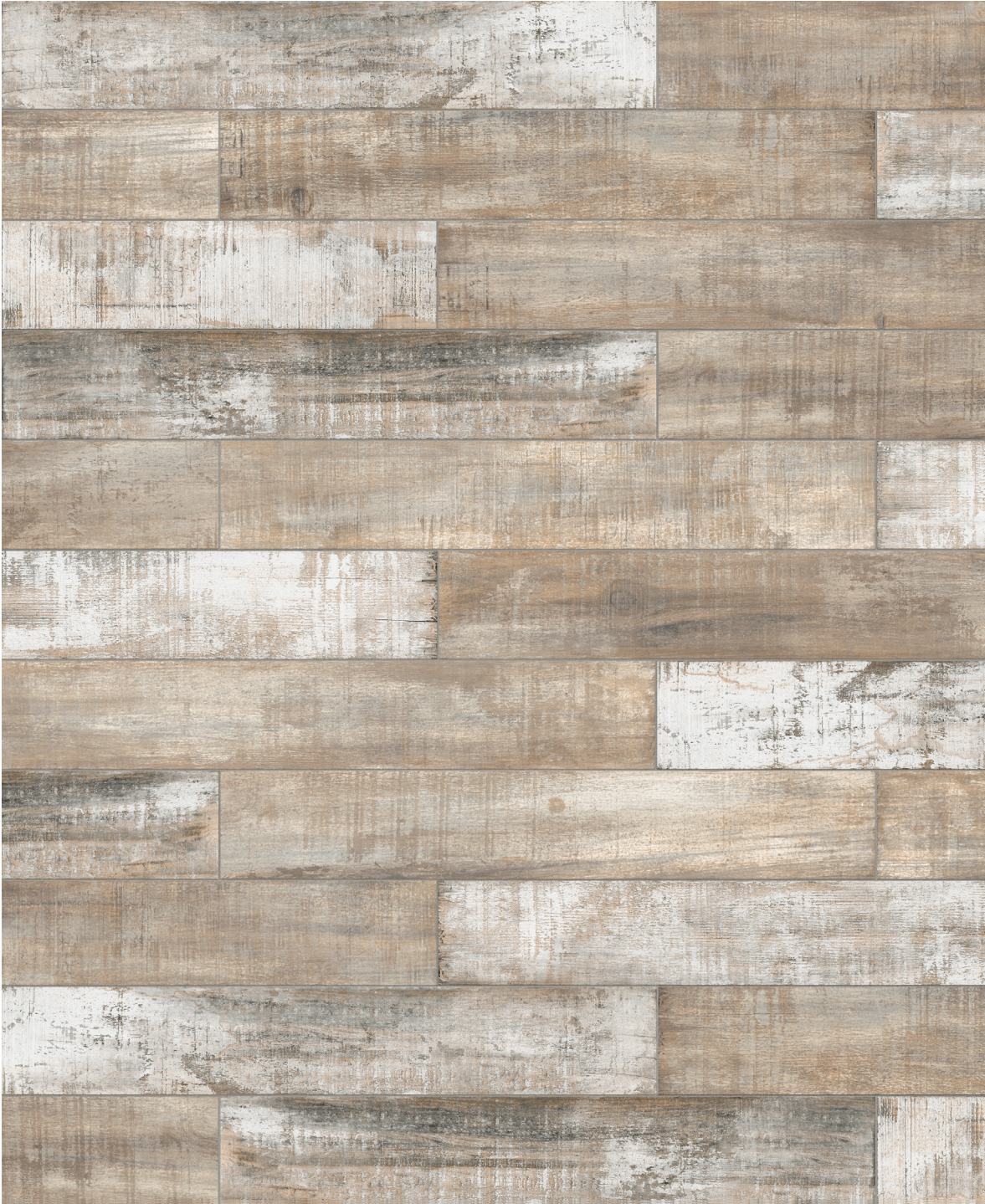
6" x 36" MUSKOKA SADDLE HD PORCELAIN TILE