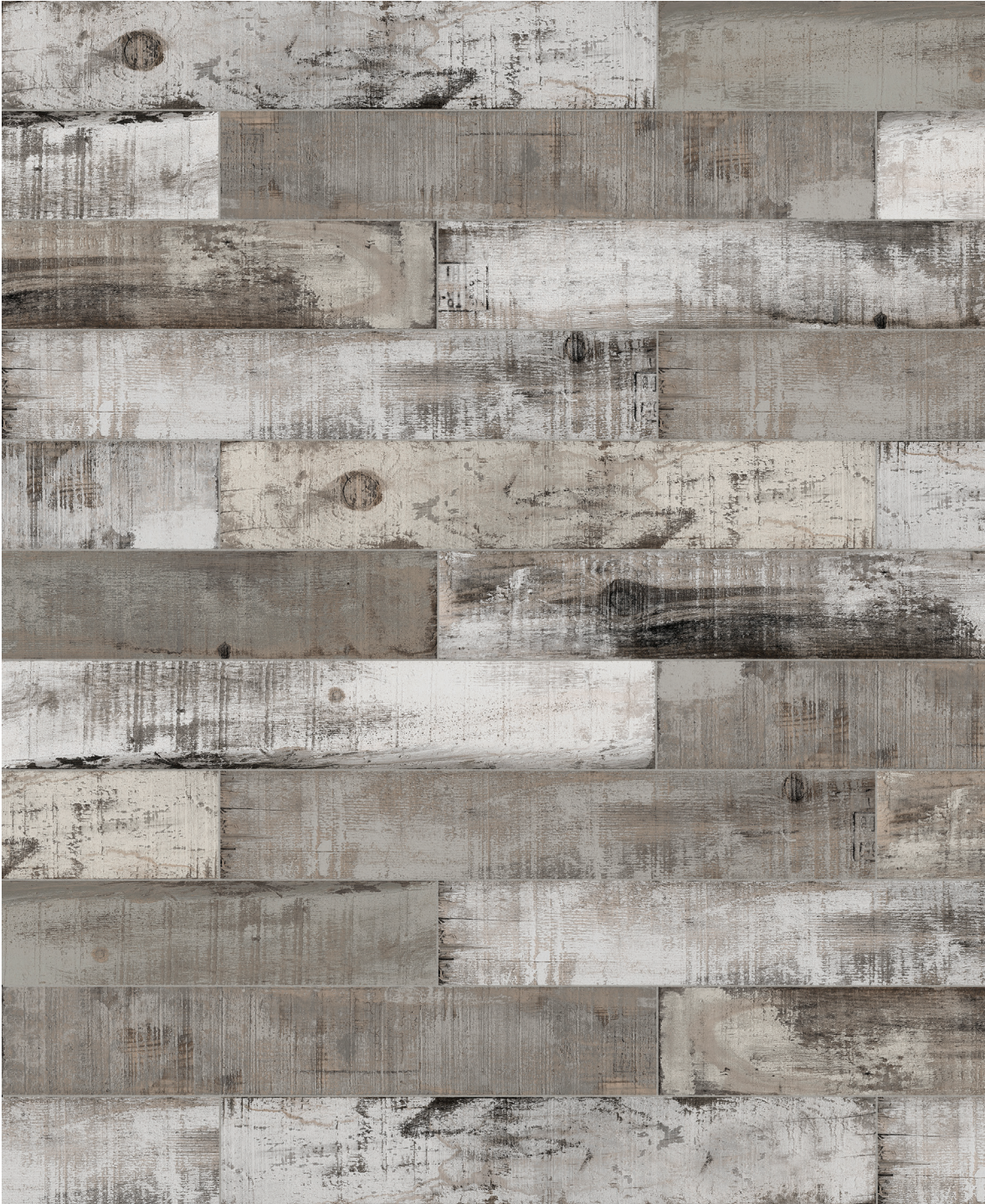
6" x 36" MUSKOKA SMOKE HD PORCELAIN TILE