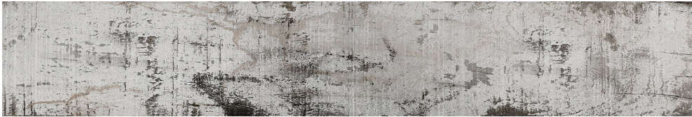
6" x 36" MUSKOKA SMOKE HD PORCELAIN TILE BFP636MSM