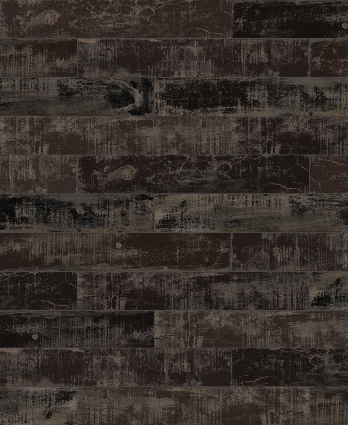
6" x 36" MUSKOKA CHARRED HD PORCELAIN TILE