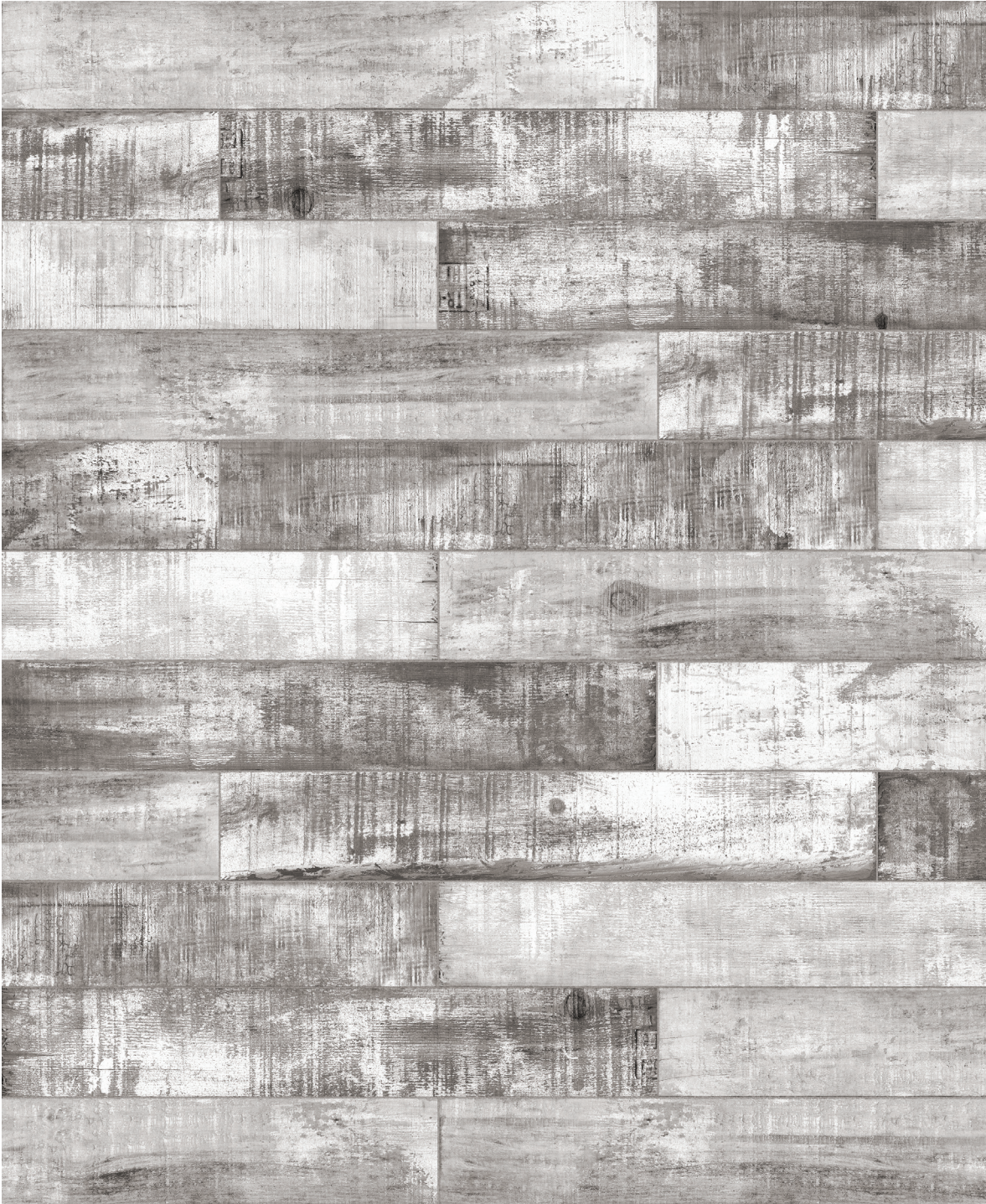
6" x 36" MUSKOKA ASH HD PORCELAIN TILE