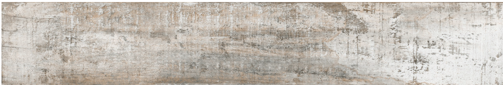
6" x 36" MUSKOKA SADDLE HD PORCELAIN TILE BFP636MSA