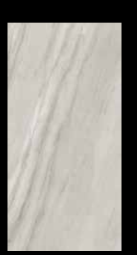
CDA1224EPLG ELEGANCE POLISHED LUXURY GREY