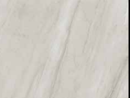
CDA1212EMLG ELEGANCE MATTE LUXURY GREY