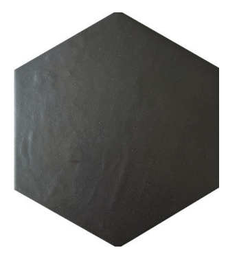
7x6 Natural Hex: EC76DHIN (25 PCS PER CTN) 28.90 LBS/CTN 7.70 SF/CTN Sold by the Square Foot Only Wear Rating: Class 3 Variation: V1

(44 PCS PER CTN) 14.65 LBS/CTN 5.40 SF/CTN Sold by the Square Foot Only Wear Rating: Class 3 Variation: V1