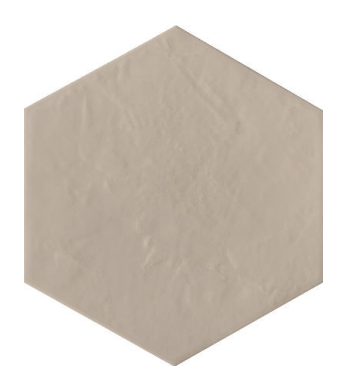
7x6 Natural Hex: EC76DHD

(44 PCS PER CTN) 14.65 LBS/CTN 5.40 SF/CTN Sold by the Square Foot Only Wear Rating: Class 4 Variation: V1