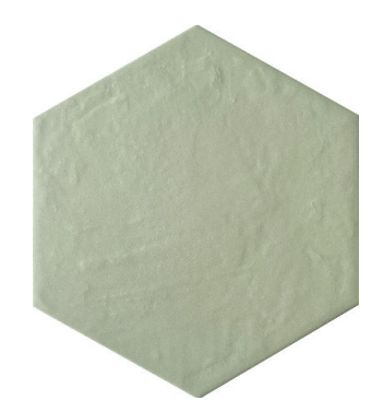
7x6 Natural Hex: EC76DHS

(44 PCS PER CTN) 14.65 LBS/CTN 5.40 SF/CTN Sold by the Square Foot Only Wear Rating: Class 4 Variation: V1