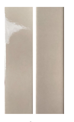
2x8 Gloss: EC28DGD 2x8: Soft: EC28DSD (50 PCS PER CTN) 16.65 LBS/CTN 5.40 SF/CTN Sold by the Square Foot Only Wear Rating: Class 4